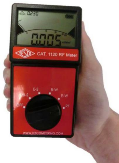
Figure 1. Proper handling of the device