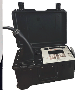
350A max DC