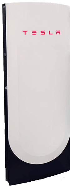
50 KW - 500 KW DCFC